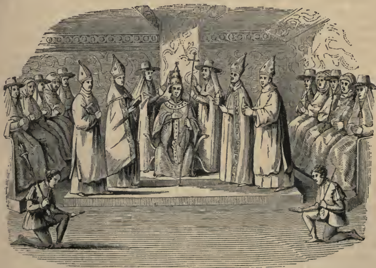
CORONATION OF POPE BONIFACE. FROM A MS. FROISSART OF THE FIFTEENTH CENTURY.

The Roman cardinals had assembled in conclave, and elected the cardinal of Naples, a prudent and courageous clerk, to the papacy, who took the name of Boniface *. The king of France